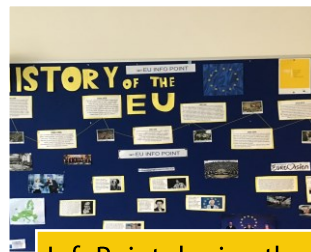
InfoPoint sharing the history of the EU