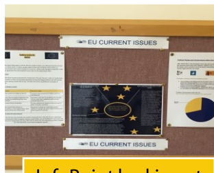
InfoPoint looking at current issues