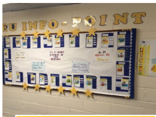
InfoPoint with a focus on languages