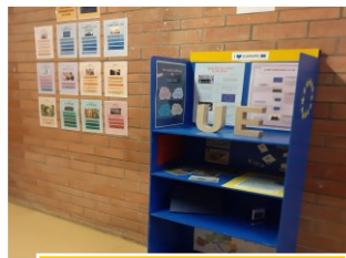
InfoPoint from Spain with leaflets