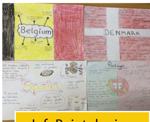
InfoPoint sharing country info