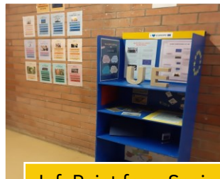
InfoPoint from Spain with leaflets