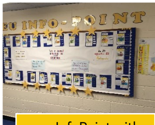
InfoPoint with a focus on languages