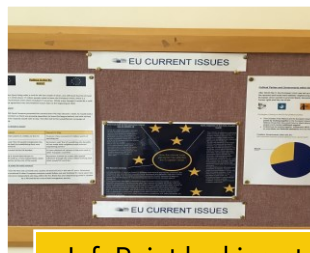
InfoPoint looking at current issues