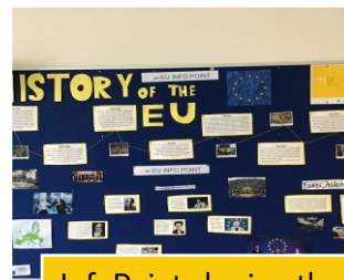
InfoPoint sharing the history of the EU