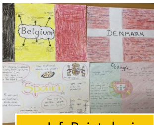
InfoPoint sharing country info